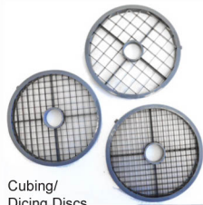
Cubing/ Dicing Discs