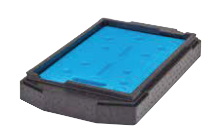
EPPCTLPKG Large handle Camchiller and Insert all in one package, available for EPP180LH.