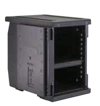
FULL 270° ACCESS Durable hinges and latches allow the door to open 270° and remain open securely to the side of the front loader for easy access to products. Latches keep door securely closed during transport.

DRIP-RESISTANT Built-in condensation barrier helps front loaders to remain drip-resistant.