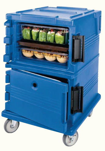
Ultra Camcarts® Insulated Food Pan Carriers