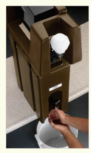
Handwash Accessory Provides a portable handwash station