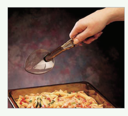
Camtensils® Acts as a barrier, reducing the risk of cross contamination