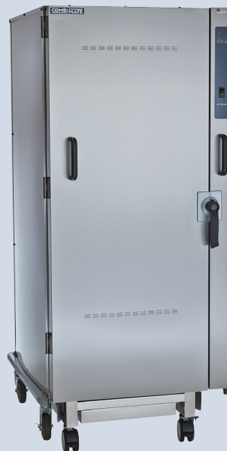
20-20MW SHOWN WITH ROLL-IN PAN CART