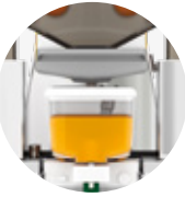
Speed Pro Cooler Podium