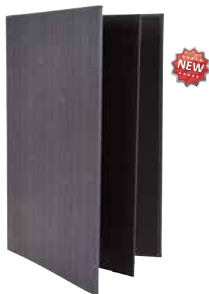
LMF-814GY FOUR-VIEW, LEGAL SIZE