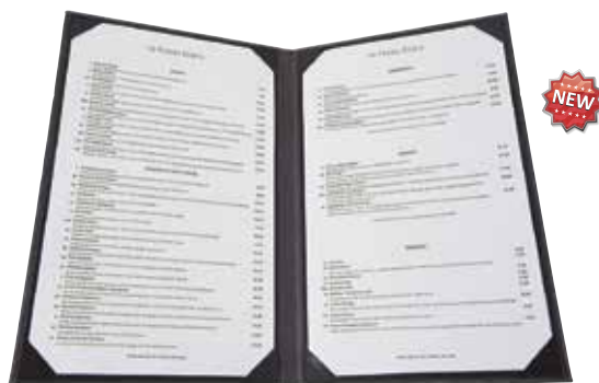
LMD-814BK TWO-VIEW, LEGAL SIZE