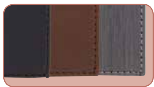
ALL MENU COVER STYLES AVAILABLE IN 3 COLORS