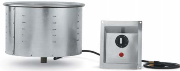
Modular Drop-In: Soup Well