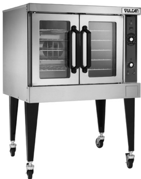
Model VC4ED Shown with optional casters