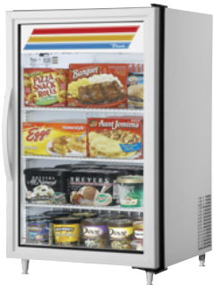
Standard White Exterior