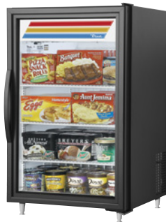
Optional Black Exterior