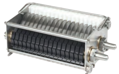
Optional Mini Slicer