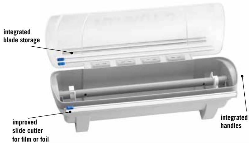
integrated blade storage