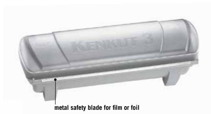
metal safety blade for film or foil