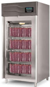
150kg Capacity Model STAGIONELLO 150 Item 40298