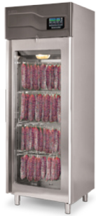
100kg Capacity Model STG100TF0 Item 41474