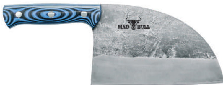
SMB-0040 SERBIAN CHEF'S KNIFE 180 MM / 7"