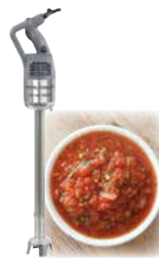
MP 550 Turbo 1.2 HP 12,000 rpm

Robot Coupe U.S.A., Inc. 264 South Perkins, Ridgeland, MS 39157 800/824-1646 • 601/898-8411 • fax: 601/898-9134 email: info@robotcoupeusa.com www.robotcoupeusa.com