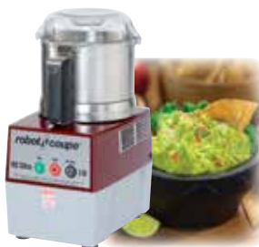
R 2 B Ultra 1 HP 1,725 rpm