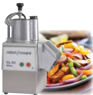
CL 50 Ultra 1.5 HP 450 rpm