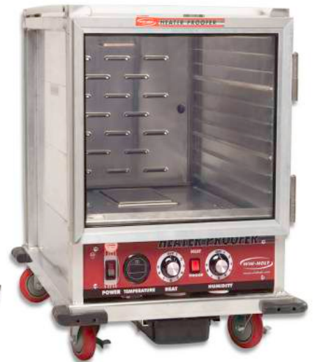
NHPL-1810HHC Fits under counters and tables.

Items highlighted in red are Express Ship! See details on page 148