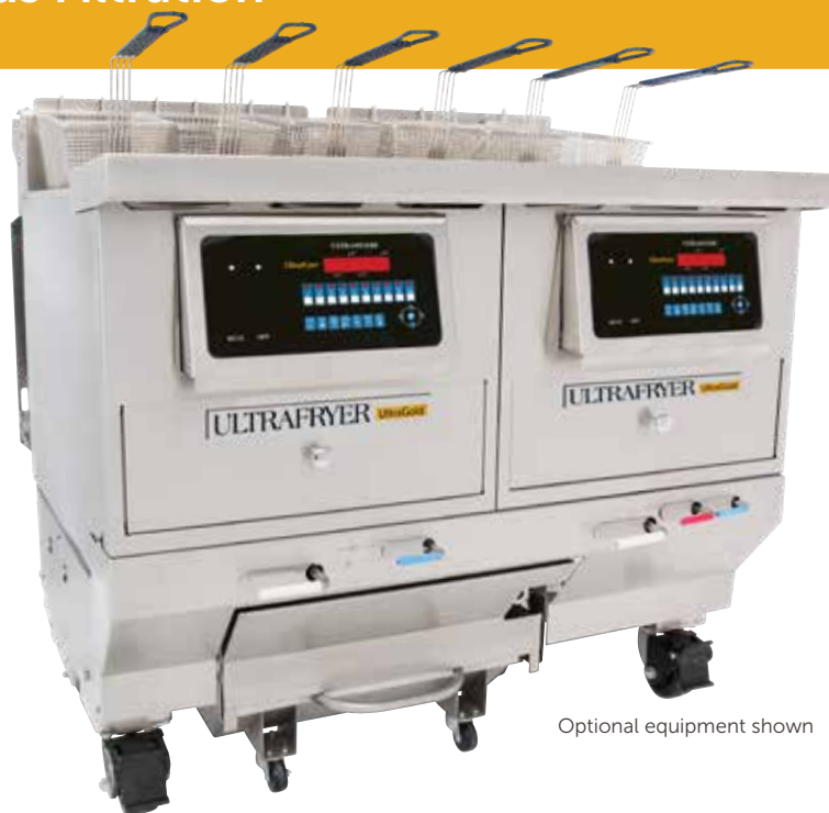
Optional equipment shown

Our patented PAR-2 phased-array heat exchanger is perfect for menu items that require consistent, low temperatures over long periods of time, such as bone-in chicken. It's designed to direct heat through baffles and turns, resulting in efficient transfer of energy to the oil and even heat distribution, virtually eliminating recovery times.