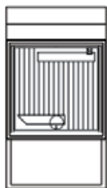
PAR-2 Heat Exchanger