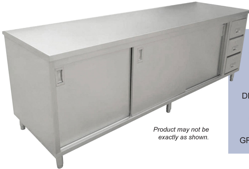
Product may not be exactly as shown.