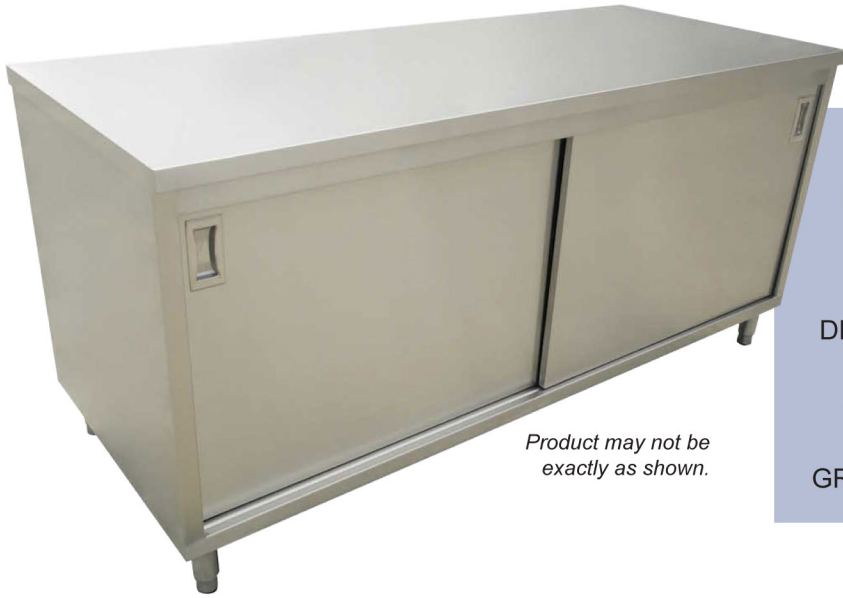
Product may not be exactly as shown.