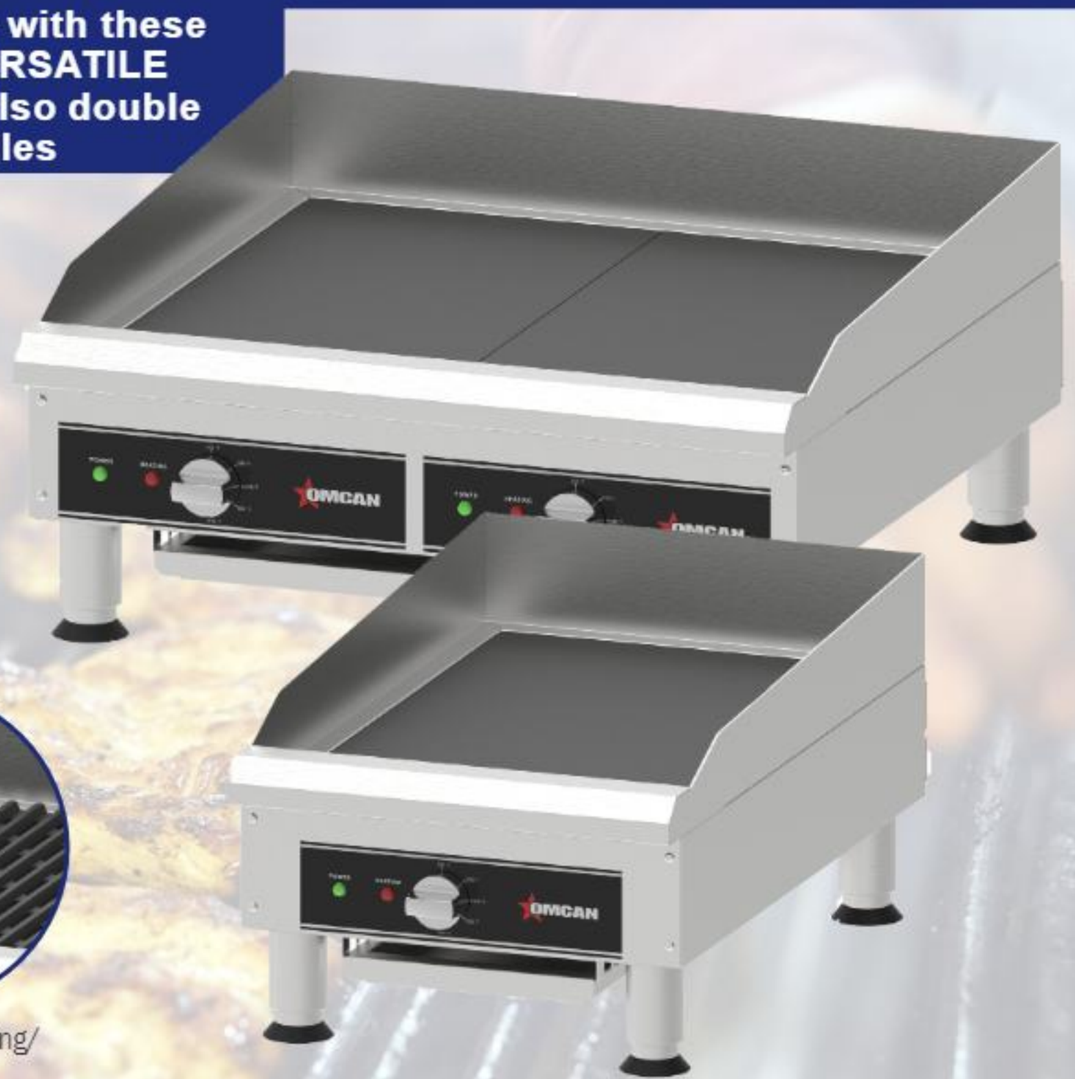
Interchangable Grilling/ Griddle Plate

Equip your kitchen with these POWERFUL & VERSATILE Charbroilers that also double up as Griddles