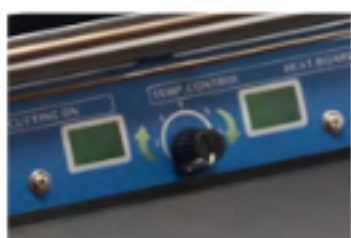
Plastic film not included

It allows to adjust sealing plate temperature for better sealing depending on film type.