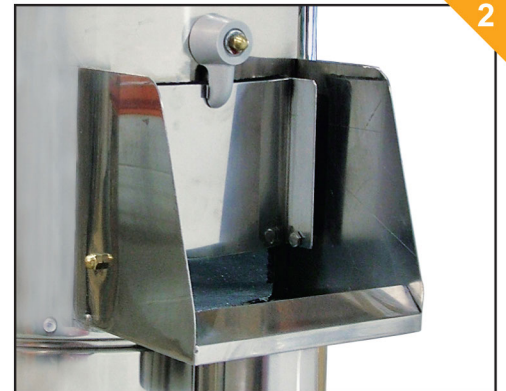
Bolt & Door