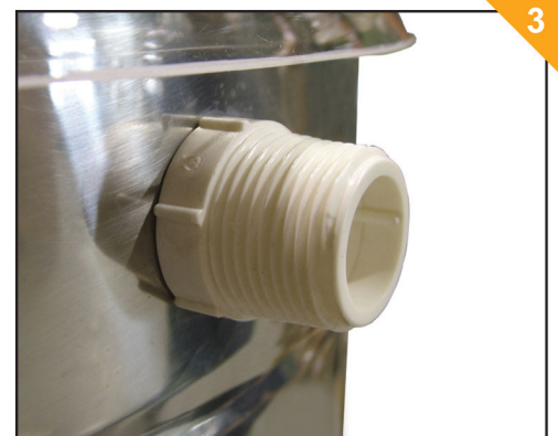
Water Inlet - 3/4" Pipe