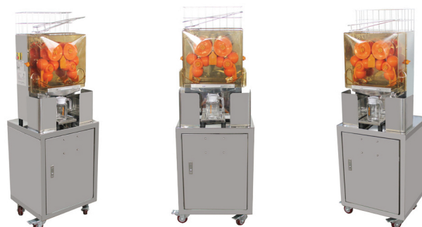
Item 44289 Stainless steel stand with a polypropylene bucket