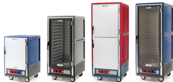
Blue ½ Height Full Solid Door