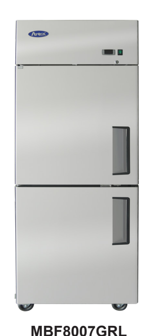
*L indicates left hand model

For the best results of food preservation we recommend setting your freezer between -8°F to 0°F