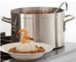
Large 5" (127 mm) stainless steel landing ledge for convenient plating.