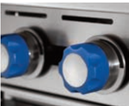
Durable cast aluminum with a vylox heat protection grip.