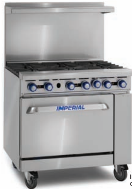
IR-6 shown with optional casters

OPEN BURNERS - PyroCentric™ 32,000 BTU (9 KW) anti-clogging burner with a 7,000 BTU/hr. (2 KW) low simmer feature. Cast iron PyroCentric burners are standard on all IR Series Ranges.