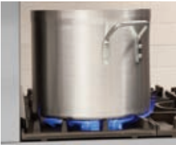
Back grate hot air dam deflects heat onto the stock pot, not the backsplash.