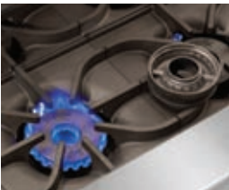
Two rings of flame for even cooking no matter the pan size.