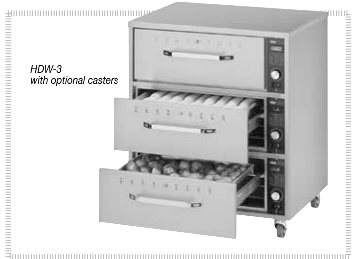
HDW-3 with optional casters