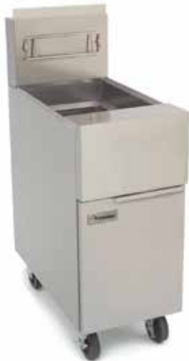
GF40 Shown with casters