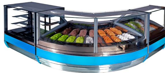
Corner model available