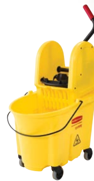
7577-88 Down Press Combo

WaveBrake® Side Press and Down Press Combos are color-coded for easy separation of cleaning by room or area to reduce cross-contamination.