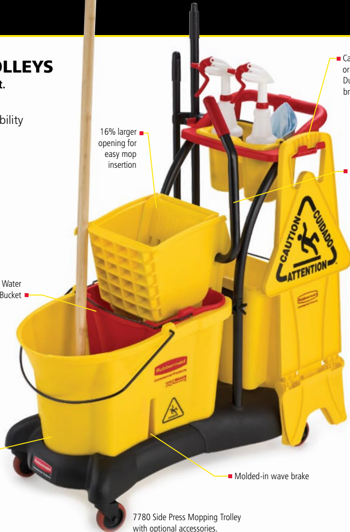
■ Molded-in wave brake