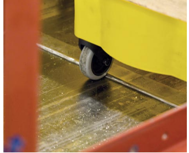
WaveBrake® casters are tested on a wide range of floor surfaces and thresholds—proving their long-lasting durability.