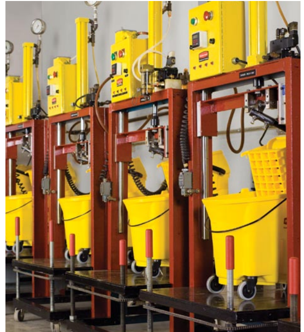
WaveBrake® wringers last twice as long as the competition, exceeding 50,000 wring cycles. We test and retest our products to meet our rigorous durability standards.