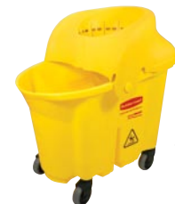
7590-88 Institutional Mop Bucket with sieve wringer.

Rubbermaid Commercial Products offers the industry's best line of mops and handles for use with WaveBrake® buckets and wringers.