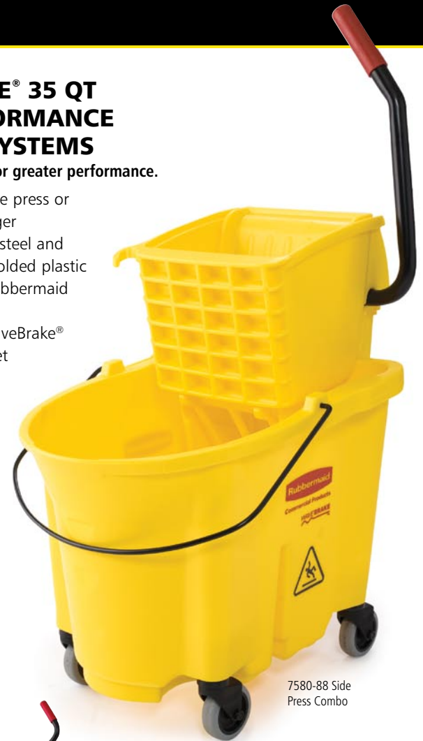
7580-88 Side Press Combo