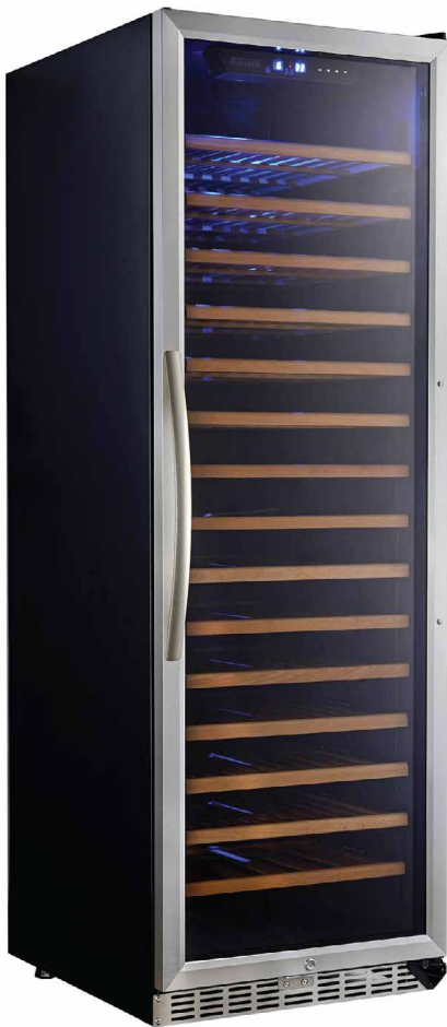
USF168S - Single Temperature

Product Warranty: 1 year on parts and labor and 3 years on the compressor.