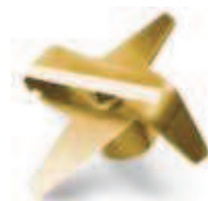
Emulsifying cutter blade - Ref. 9414