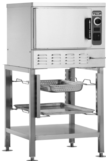
Shown on accessory stand with extra set of pan slides and pans