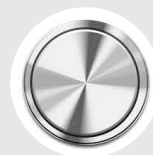
Stainless steel housing