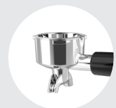
51mm Stainless steel portafilter