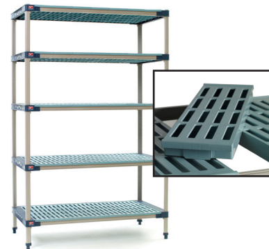
Five Tier Starter Unit