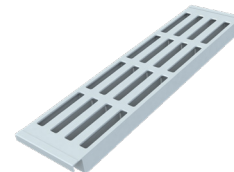
Open Grid Mat