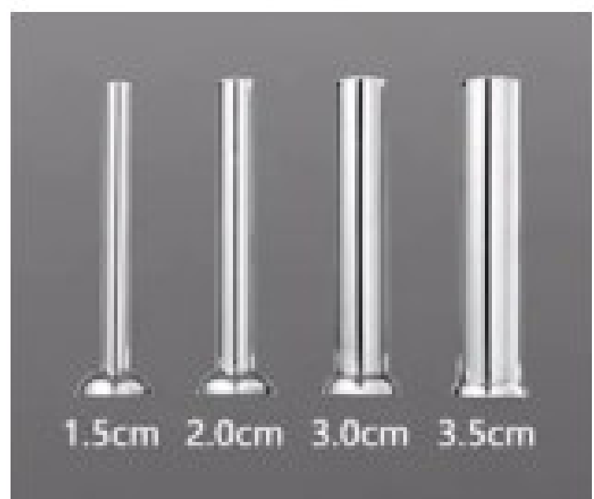
Comes with 4 sausage filling tubes