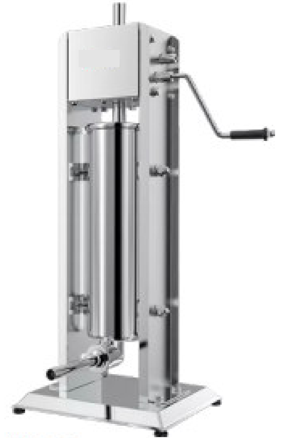
#47539 7 kg / 15 lb. Manual