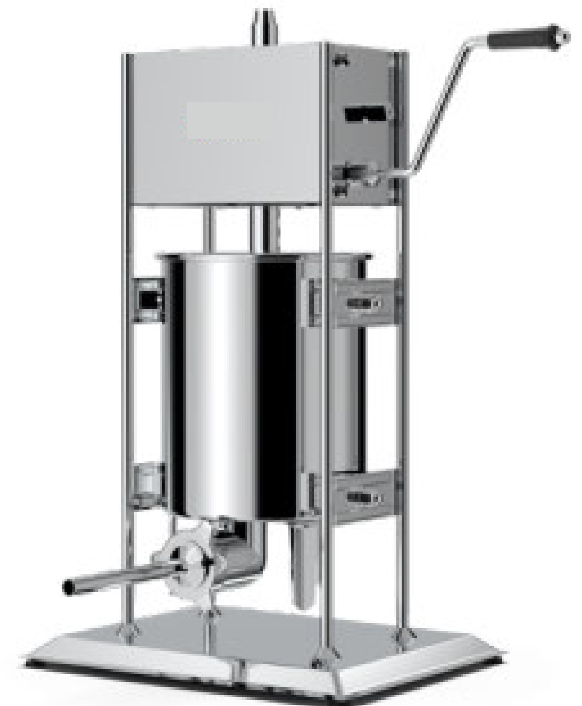
#47500 15 kg / 33 lb. Manual