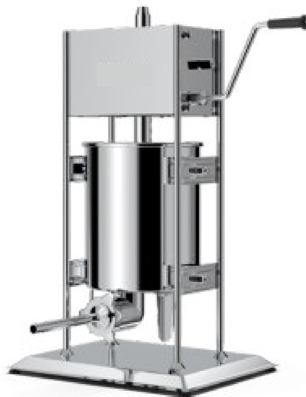
#47499 10 kg / 22 lb. Manual