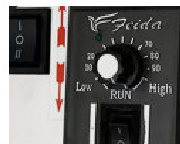
Two stuffing speeds

High-quality stainless steel frame and filling tubes.