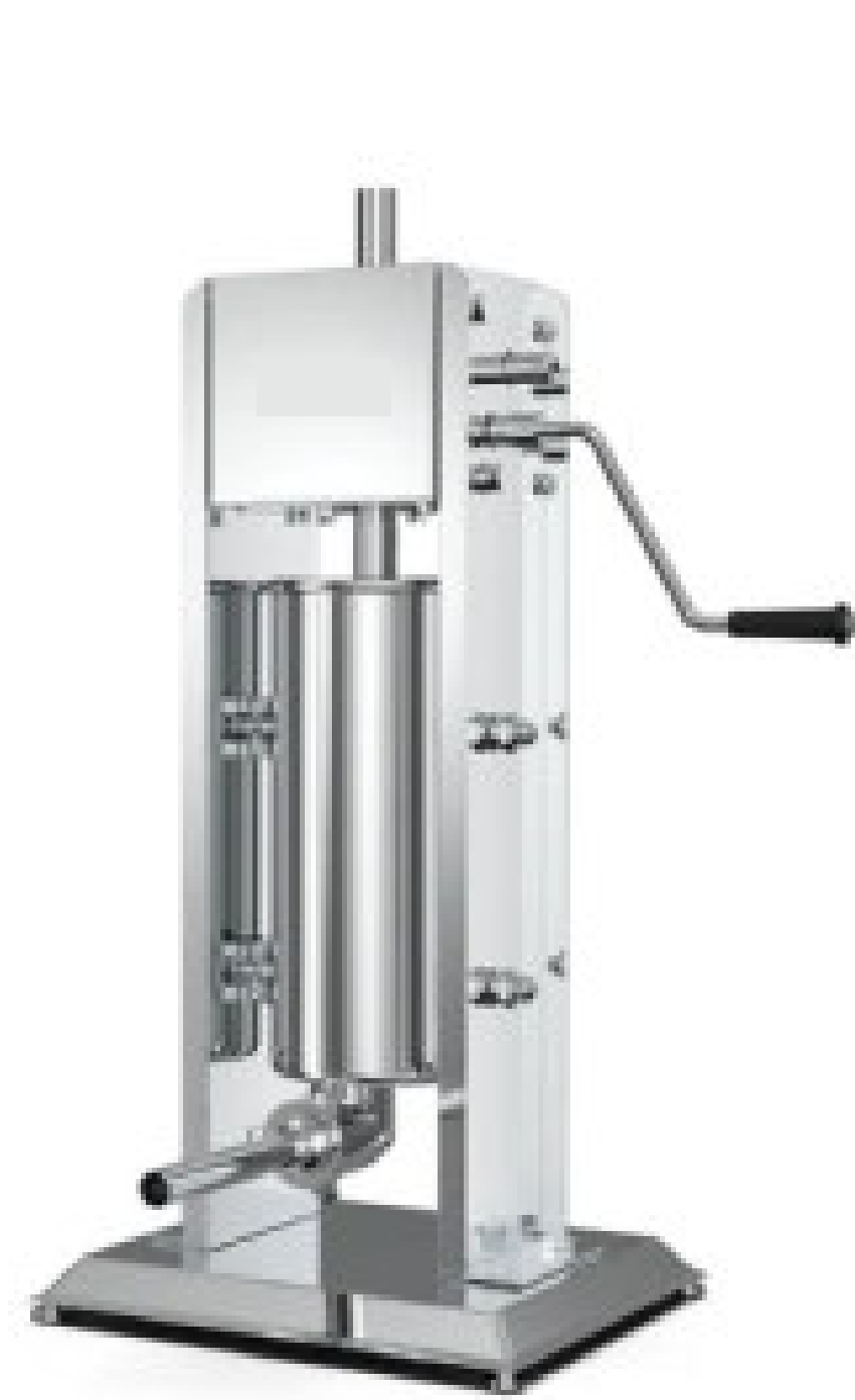
#47432 5 kg / 11 lb. Manual