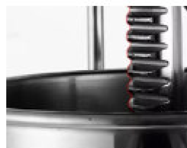
Powerful and Durable

Removable cylinder for easier filling and cleaning, healthier and more