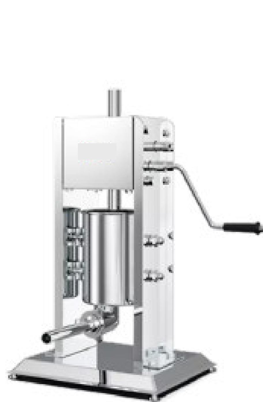
#47538 3 kg / 7 lb. Manual