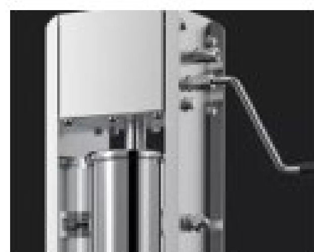
Rust-proof and Dismountable Body

Removable cylinder for easier filling and cleaning, healthier and more