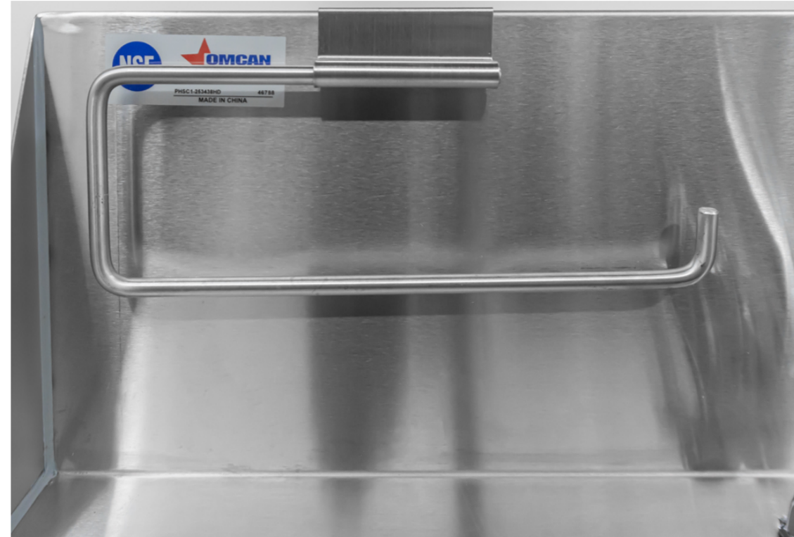
TOWEL PAPER DISPENSER