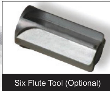
Six Flute Tool (Optional)