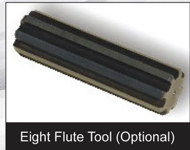
Eight Flute Tool (Optional)