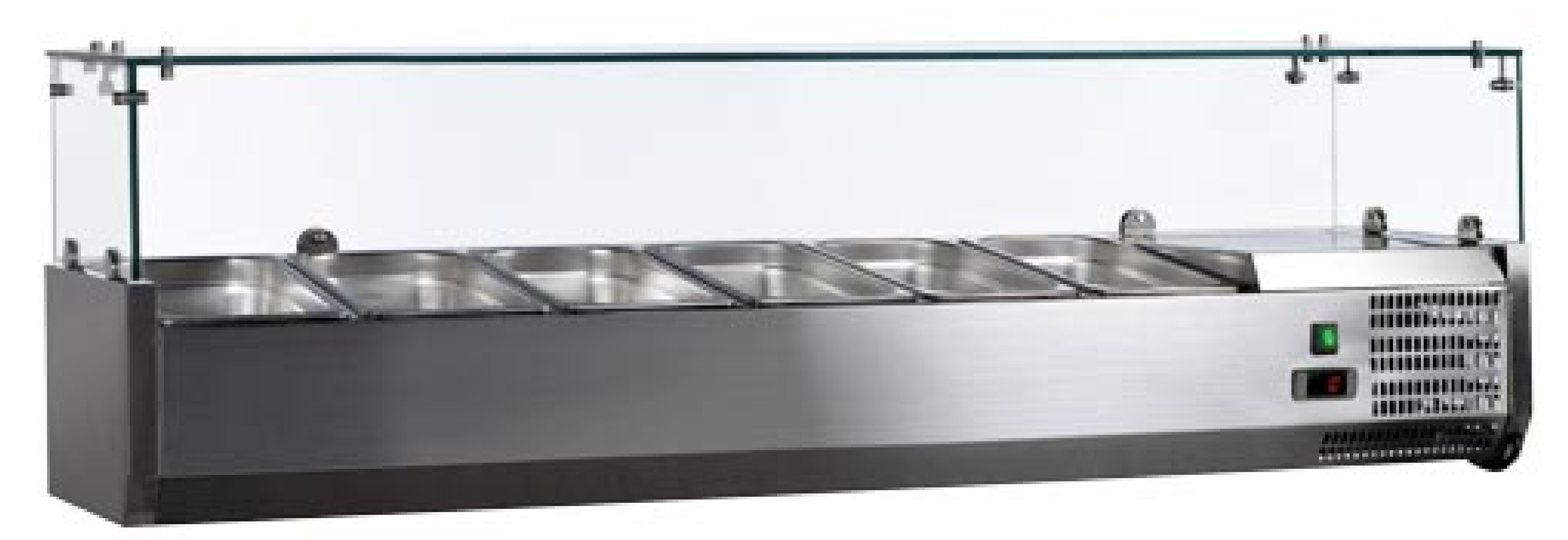
Pans not included

These refrigerated topping rails are perfectly designed to store and keep all ingredients fresh to a certain temperature holding time. Easy to accommodate various combination size of plastics or stainless steel table pans.