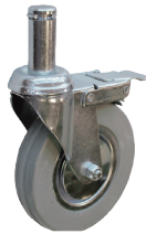
5" Industrial Caster With Brakes