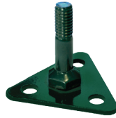
Foot Plate for Wire Shelving