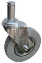
5" Industrial Caster Without Brakes