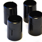
Black Abs Sleeves