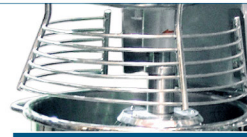
► Safety Guard

This mixer has 3 speeds. It comes complete with 3 attachments, a stainless steel bowl, and a safety guard