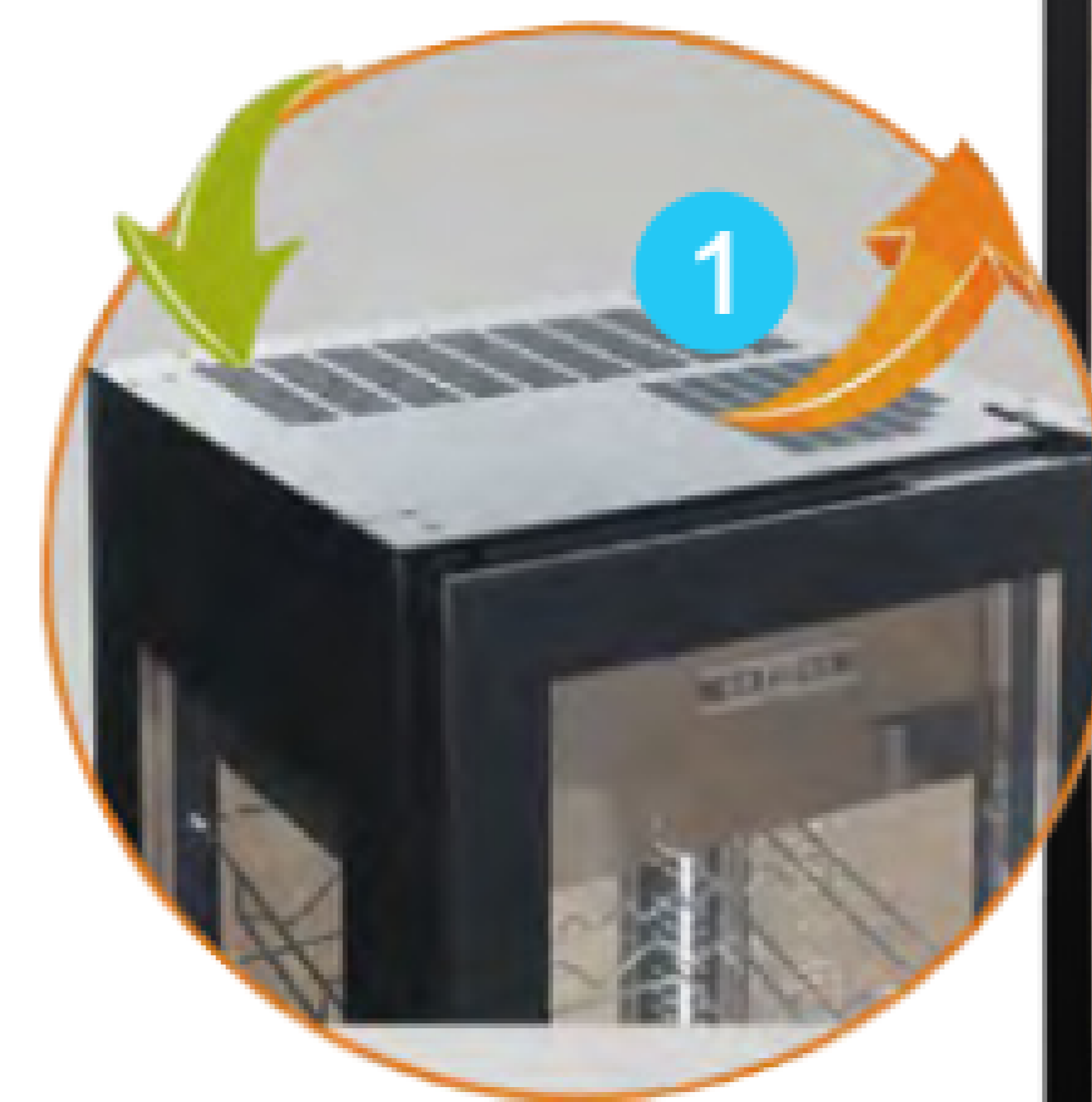
Cold and hot air exchange on top