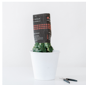
Leave all wrappings on for ONE HOUR during initial hydration.