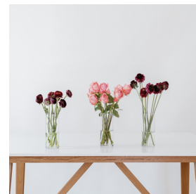
Prep Photo Examples