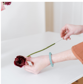
Flower Support Submission Form