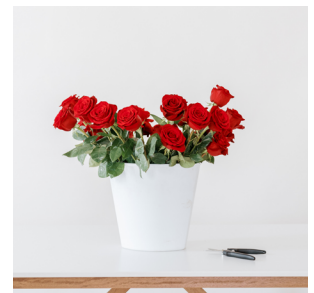
One bunch of roses per hydration container - no crowding!