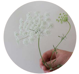
Queen Anne's Lace