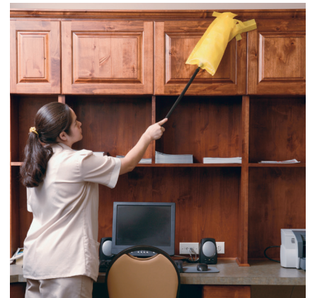
Dust cluttered desks, blinds and computers