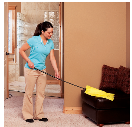
Safe for any surface, contains no oils or waxes