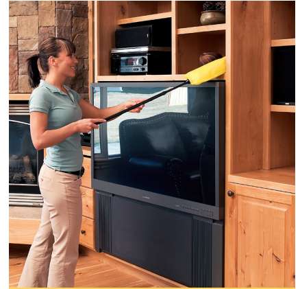
Dust around any shaped objects

ProDuster sleeves will prolong the life of your wool duster, making them much more economical to replace than the entire duster.