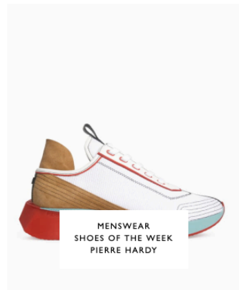
MENSWEAR SHOES OF THE WEEK PIERRE HARDY