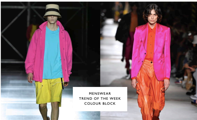
MENSWEAR TREND OF THE WEEK COLOUR BLOCK