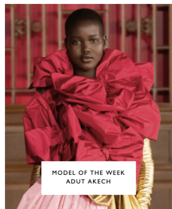
MODEL OF THE WEEK ADUT AKECH