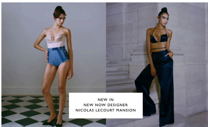
NEW IN NEW NOW DESIGNER NICOLAS LECOURT MANSION