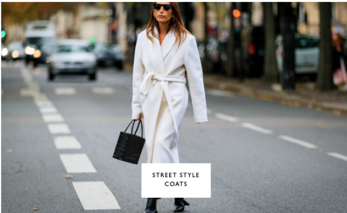
STREET STYLE COATS

WORD OF THE WEEK: COLOURED ANIMAL PATTERN SEE THE LOOKS IN WOMAN