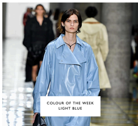
COLOUR OF THE WEEK LIGHT BLUE

WORD OF THE WEEK: COLOURED ANIMAL PATTERN SEE THE LOOKS IN WOMAN