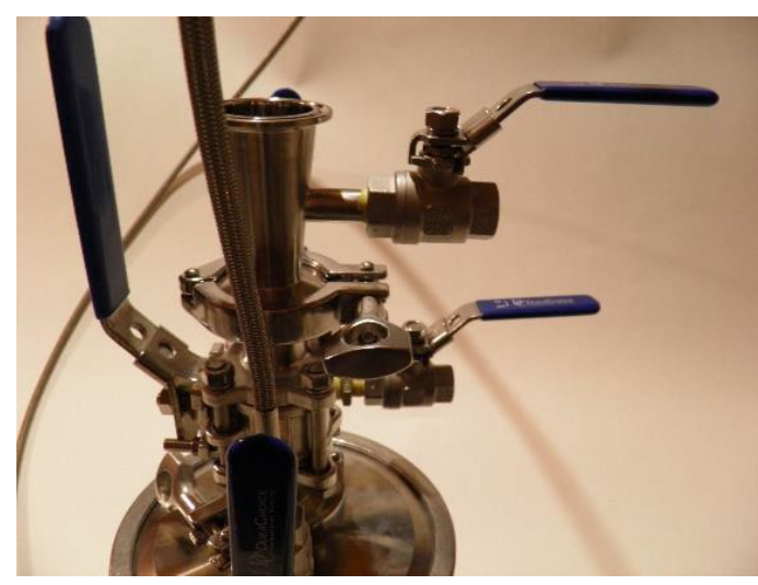
Figure 17: Concentric reducer attached to 3-Piece Ball Valve.

Next, Attach the concentric reducer to the 3-piece valve with a gasket and tri clamp.