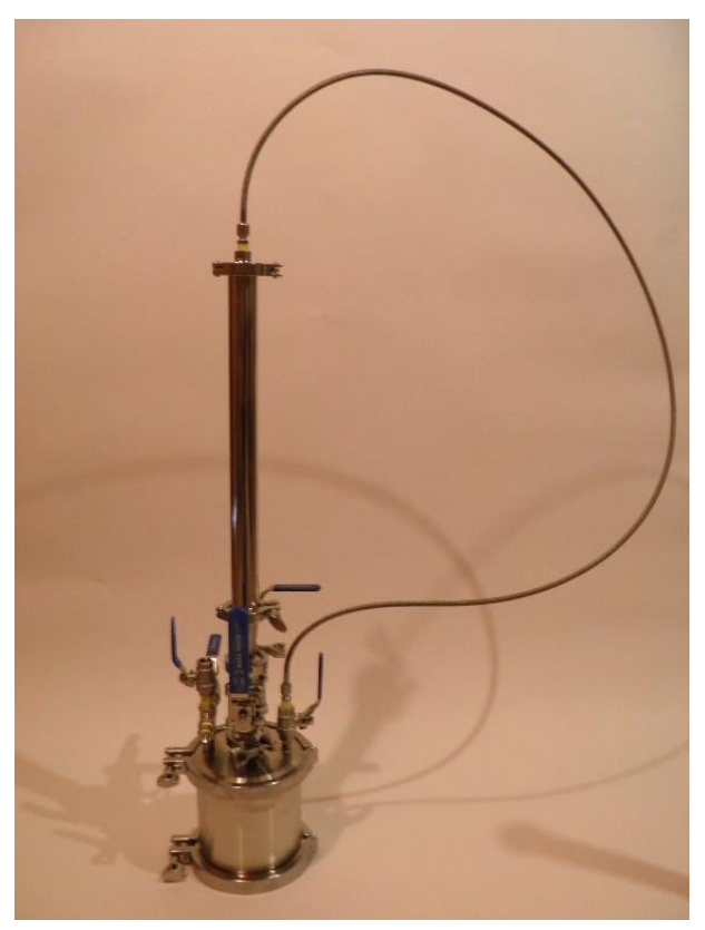
Figure 19: Completed unit.

Next, attach the cap end of the hose to the top of your column with a gasket and triclamp.