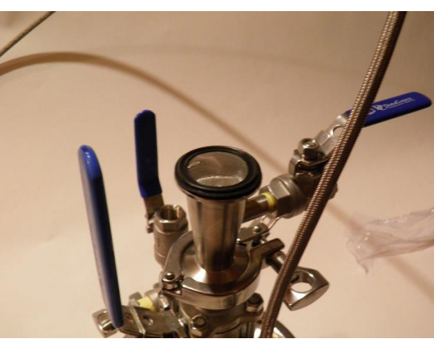
Figure 18: Mesh Gasket.

Place a 150 Mesh gasket on the concentric reducer and attach your column with a tri clamp.