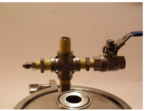
Figure 8: 3/8" Close Nipple in Cross

Hand tighten a 3/8" MNPT x 3/8" MNPT to the top of the cross. Be sure the PTFE tape is wrapped around the close nipple prior to attaching.