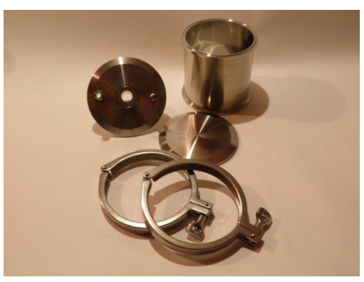
Figure 1: Stainless collection pot items and MKIII lid

Begin by using paper towels and Isopropyl Alcohol to clean all stainless pieces and gaskets for the collection pot. Attach the 6" end cap to one end of your collection pot with the provided 6" gasket and tri clamp.