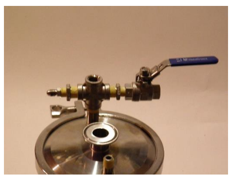
Figure 7: MKIII Lid with ¼" WOG attached to cross.

Next, Attach the 1/4" MNPT x 1/4" MNPT to the opposite side of the cross, and hand tighten it. Afterwards, attach a \frac{1}{4} " WOG Valve to the close nipple and secure it with a wrench, ensuring the handle is upright when fully tightened.