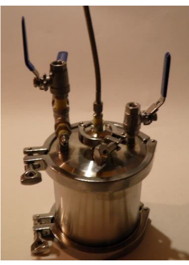
Figure 12: Attached hose.

Next, Attach the \chi'' hose to the cap after wrapping it with PTFE tape. Tighten the hose with a wrench.