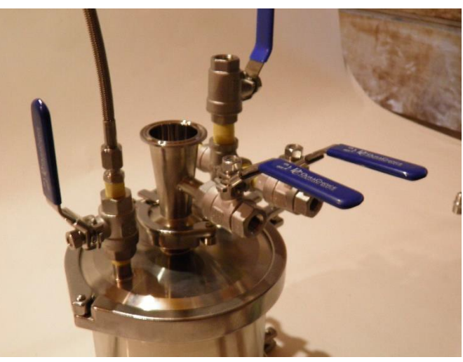
Figure 15: Concentric reducer with attached ¼" Valve

Next, be sure you have taped the threads on the concentric reducer. Using a gasket and clamp, attach the reducer to the MKIII lid, and attach a ¼" Valve to the reducer. Secure with a wrench so that the last turn leaves the handle facing up. Once the valve is attached remove it from the lid.