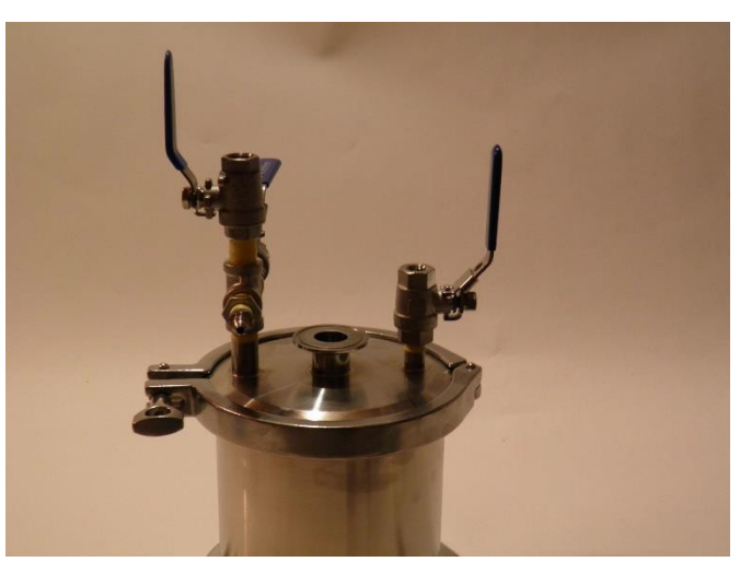
Figure 10: ¼" Valve attached to lid.

Next, attach a ¼" WOG Valve to the ¼" MNPT on the MKIII Lid. Tighten with a wrench and ensure the handle is oriented outward on its last turn. On the opposite side, tighten the 1/4" valve cap to the 1/4" MJIC fitting. This is provided for optional bi-directional support.