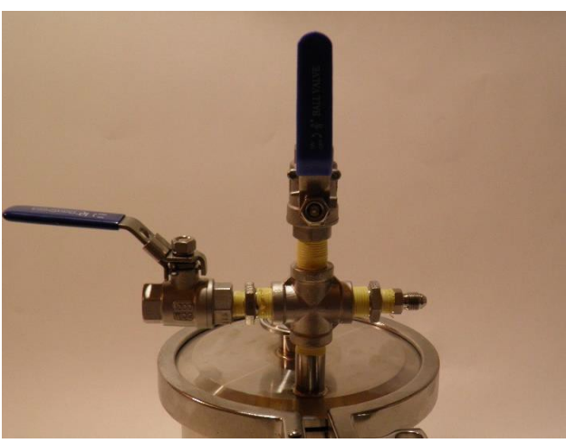
Figure 9: 3/8" Valve attached.

Attach a 3/8'' WOG Valve to the 3/8'' \times 3/8'' . With a wrench, tighten the valve, ensuring it is facing outward on its last turn.