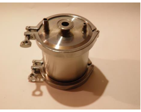
Figure 3: Collection pot with MKIII lid installed

Next, Attach the MKIII lid to the other end of your collection pot with the remaining 6" gasket and tri clamp.