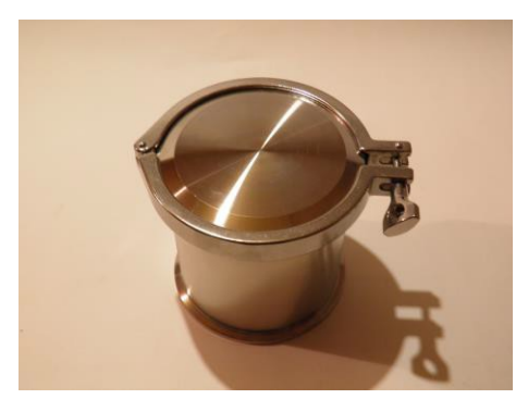
Figure 2: Collection pot with end cap installed

Begin by using paper towels and Isopropyl Alcohol to clean all stainless pieces and gaskets for the collection pot. Attach the 6" end cap to one end of your collection pot with the provided 6" gasket and tri clamp.