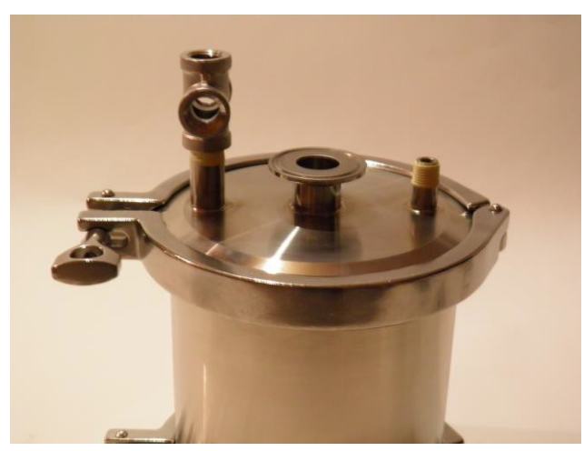
Figure 4: Attached Cross.

Start off by applying PTFE Tape to the MNPT ends of your MKIII lid. Once the tape has been applied attach the 3/8" Cross to the lids 3/8" MNPT. Once hand tightened, use your pliers to tighten the cross.