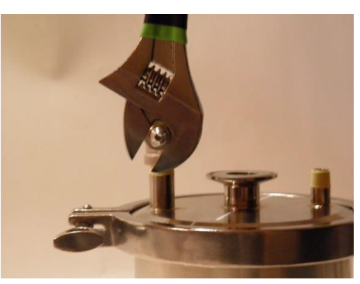
Figure 6: ¼" Flare to cross.

Attach the 1/4'' MNPT x 1/4'' MJIC fitting to the 3/8'' x 1/4'' bushing on the right side of the cross. Use a wrench to firmly secure the fitting.