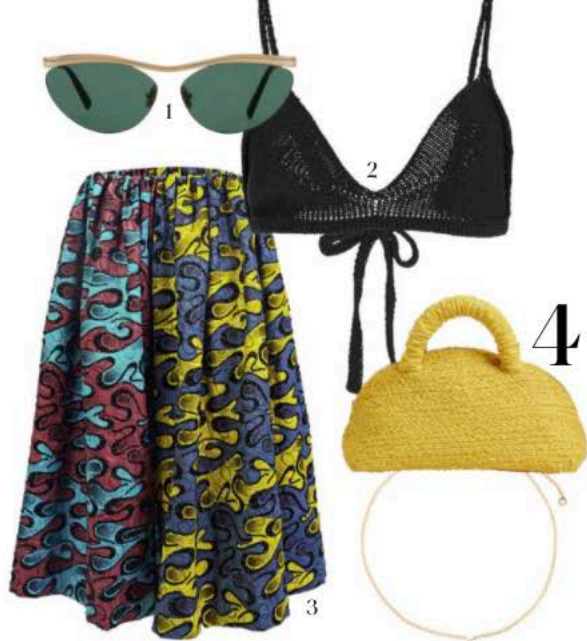
1. Sunglasses, Tod's, $335, tods.com . 2. Bralette, Khaite, $560, khaite.com . 3. Skirt, Lisa FolaWiyo, $932, lisafolawiyo.com . 4. Handbag, Merlette, $500, merlettenyc.com . 5. Anklet, Yvonne Léon, $683, matchefashion.com . 6. Sandal, Christopher Esber, $710, christopheresber.com.au .