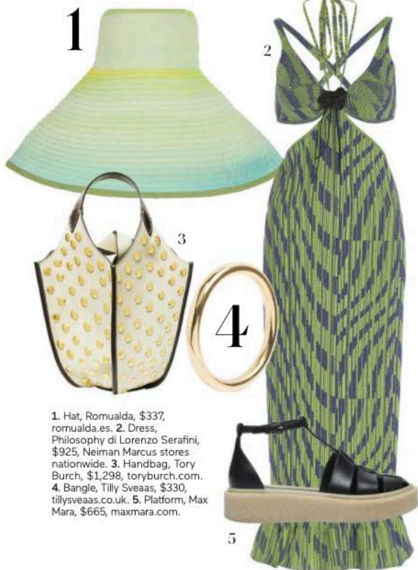
1. Hat, Romualda, $337, romualda.es . 2. Dress, Philosophy di Lorenzo Serafini, $925, Neiman Marcus stores nationwide. 3. Handbag, Tory Burch, $1,298, toryburch.com . 4. Bangle, Tilly Sveaas, $330, tillysveaas.co.uk . 5. Platform, Max Mara, $665, maxmara.com .