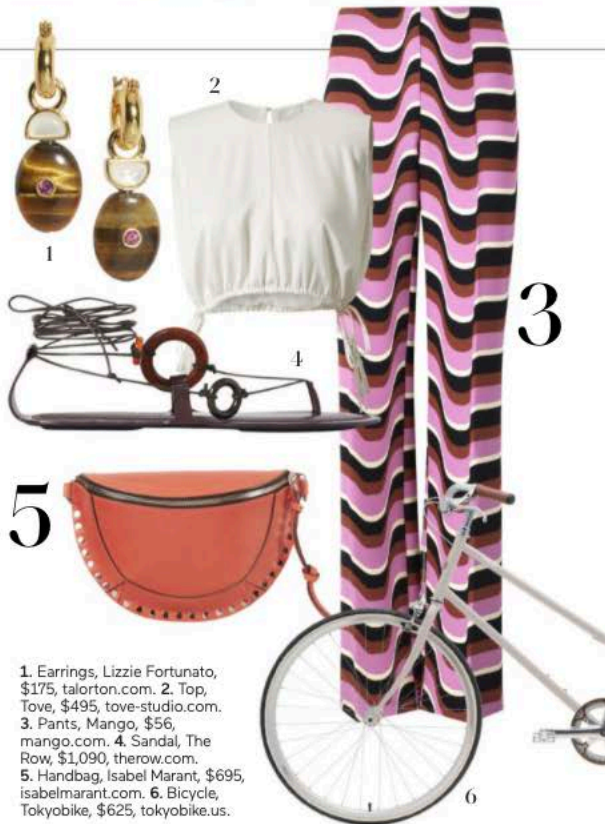
1. Earrings, Lizzie Fortunato, $175, talorton.com . 2. Top, Tove, $495, tove-studio.com . 3. Pants, Mango, $56, mango.com . 4. Sandal, The Row, $1,090, therow.com . 5. Handbag, Isabel Marant, $695, isabelmarant.com . 6. Bicycle, Tokyobike, $625, tokyobike.us .