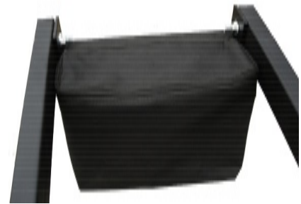
Optional CobraCrane Weight bag

Add some small weights to the weight stack on the back or pull the weight belt back towards the weight bracket. Whenever you add anything (or remove an accessory) you are changing the weight of the camera, thus the counterweight must be changed. Keep a supply of 1.25, 2.5 and 5lb weights or purchase one of our CobraCrane Weight Bags. This will allow you to be able to balance your crane wherever you are. You never want to be out on a shoot and not have the right amount of weight. We always keep the weight bag around so we can always add some rocks, or bolts or anything else. This way we always prepared for big and small batteries and anything else thrown our way.