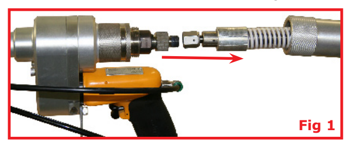
Step 2: Unscrew the Swivel Bearing Retaining

Step 1: Unscrew the Hose Protector from the back of the APS COBRA, and disconnect the high pressure hose from the Inlet Adapter (Fig 1).